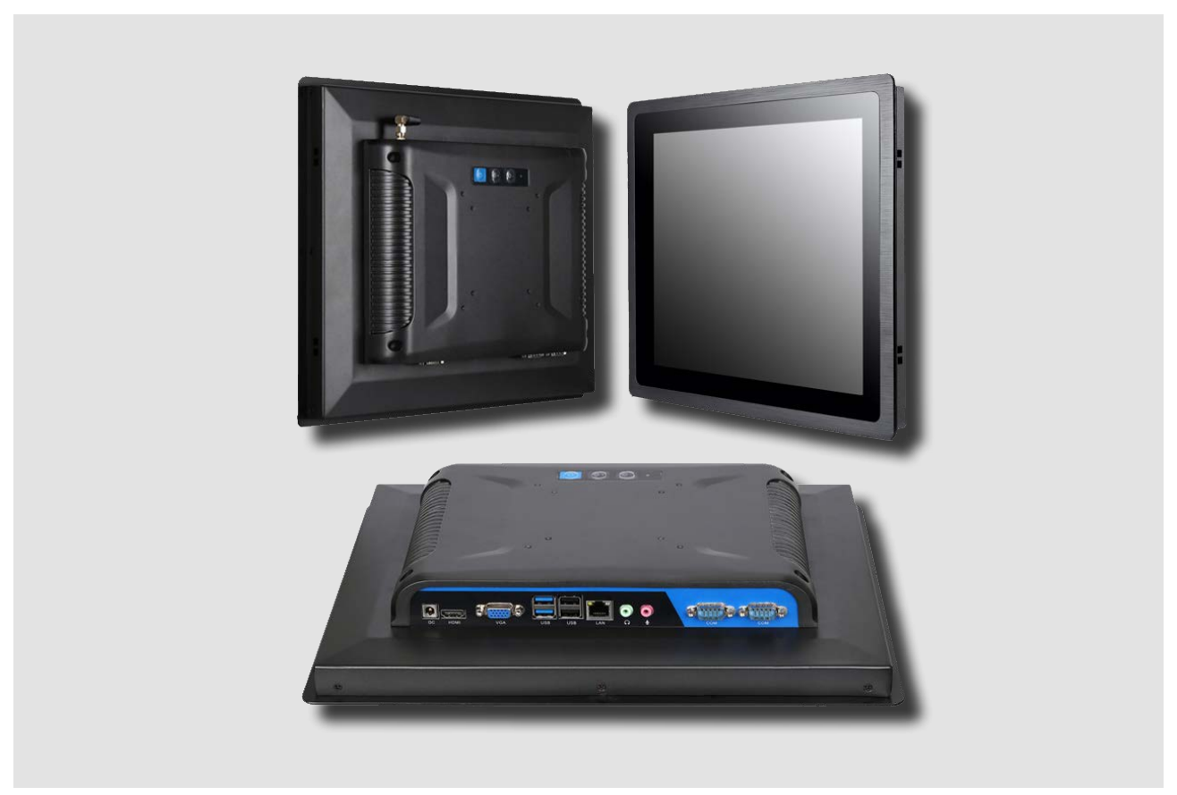
GKI 300 side connections and front view.