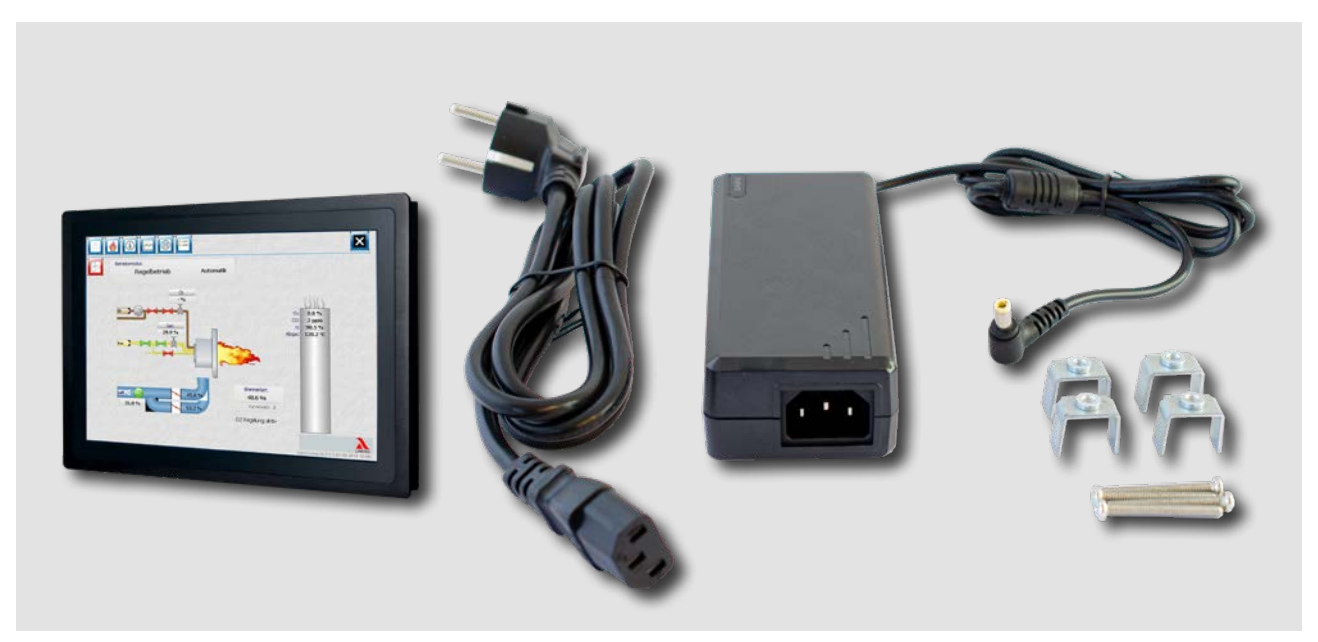
GKI300 - What's in the box?

As a standard, the GKI300 would be delivered as follows: